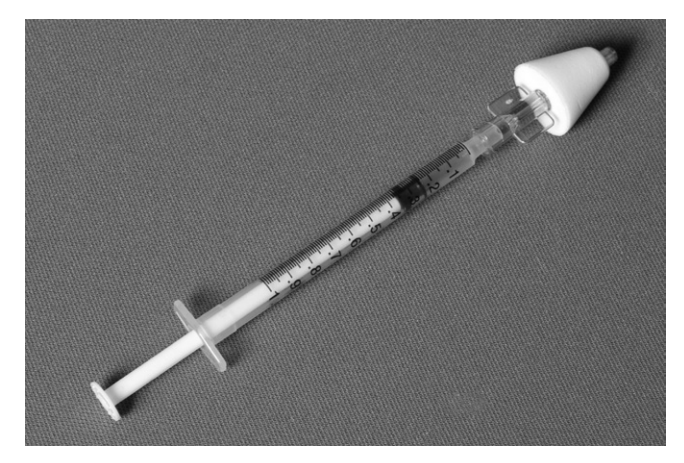
Figure 1. Mucosal Atomiser Device.

A convenience sample of children aged 7 to 15 years, presenting with clinically deformed closed long-bone fractures, was identified at triage and invited to join the study. Verbal consent was obtained from both the accompanying parent and the child, when appropriate. Written consent was not obtained to minimize "time to analgesia" in the setting of acute extreme pain. These ethical issues were discussed with the institution's ethics committee and approval was obtained. These findings were consistent with published guidelines for ethical research.<sup>10</sup>